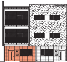
Typical elevation, 15th and 16th streets