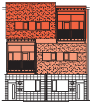
Typical elevation, 15th and 16th streets