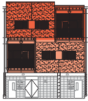
Typical elevation, interior courtyard